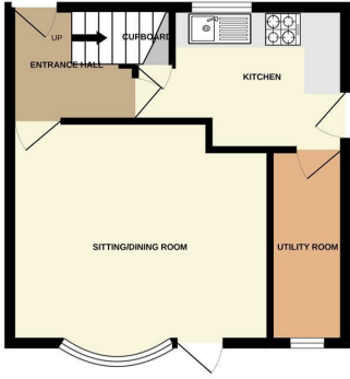
GROUND FLOOR 346 sq.ft. (32.2 sq.m.) approx.